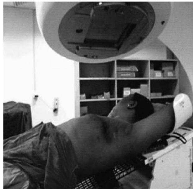
Fig no; 2: Patient is on Radiotherapy (LINAC machine) treatment couch.

After surgery she received total 8 cycles of chemotherapy till 31-05-2009. First 4 cycles were FAC (Inj.FU 750 mg+Inj. Adriamycin90 mg + Inj. Cyclophosphamide 900mg) and the rest 4 cycles were Inj.Taxotere 80mg +Inj. Doxorubicin 90mg i.v. X 3 Weekly cycles. Then we start loco-regional radiotherapy for her (Fig no : 2) into the left breast area from 29-07-2009 to 06-09-2009. Thereafter we