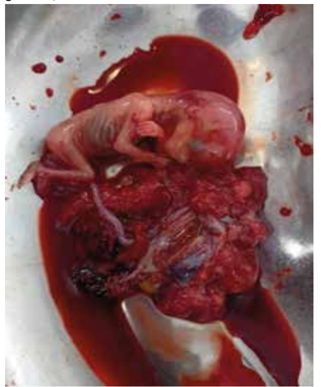
Figure 2: Extracted fetus with placenta