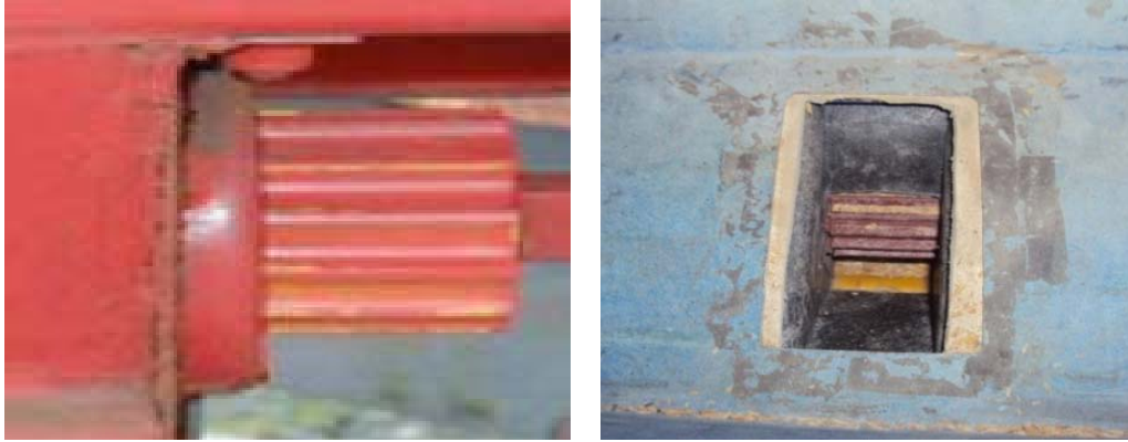
Fig. 1. Fluted wheel type seed metering device

Fluted roller type seed metering device was used in the previous version of zero till drill which caused seed damage during operation.