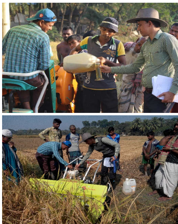
Figure 5. Fuel measurement after harvesting of paddy.

Economic analysis: Economic performance evaluation of mini-combine harvester and reaper for the harvesting of paddy especially cost of operation of an agricultural machine was determined by calculating fixed cost and variable costs. Harvesting cost and time of mechanical harvesting system were also compared with manual harvesting.