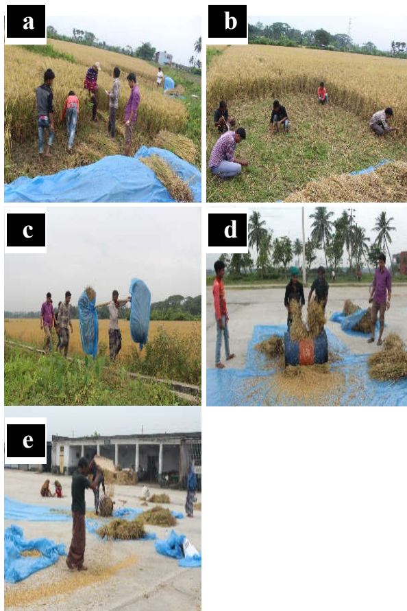
Figure 2. Pictorial views on manually paddy harvesting to cleaning. (a) reaping, (b) grain collection, (c) carrying, (d) threshing & (e) cleaning.

Traditional/manual harvesting using sickle: For the determination of manual harvesting cost, labor requirement, time and harvesting losses, 3 (three) plots were selected and all plots were harvested by manually. From harvesting to cleaning, all operations were done by manually. Manual losses were estimated considering a) shatter loss, b) cutting loss, c) gathering loss, d) carrying loss, e) threshing loss and f) cleaning loss since combine harvester does all these operations in single pass. All losses were calculated carefully as shown in Figure 2.