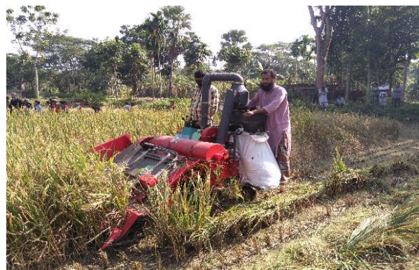
Figure 3. Harvesting by mini-combine

Modern/mechanical paddy harvesting using mini-combine and reaper: For the determination of mechanical harvesting cost, labor requirement, time and harvesting losses, selected plots were harvested by using mini-combine and reaper. During harvesting using mini-combine harvester, from harvesting to cleaning all operations were done in a single operation as shown in Figure 3. On the other hand, after harvesting with reaper, remaining operations like threshing was done by power thresher (shown in Figure 4) and carrying, winnowing & cleaning were done by manually.