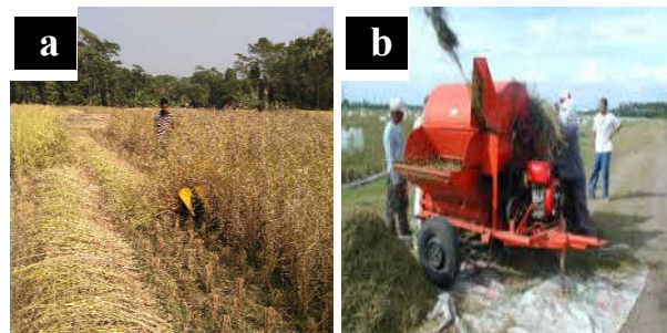
Figure 4. (a) Harvesting by reaper, (b) threshing by power

Field test: Before field test of the machines, soil condition, crop condition, no of tiller/hill and yield conditions were recorded. For the field performance test, average plant height was also measured using a measuring tape. The moisture content of the soil was measured by a digital moisture meter. The plot size