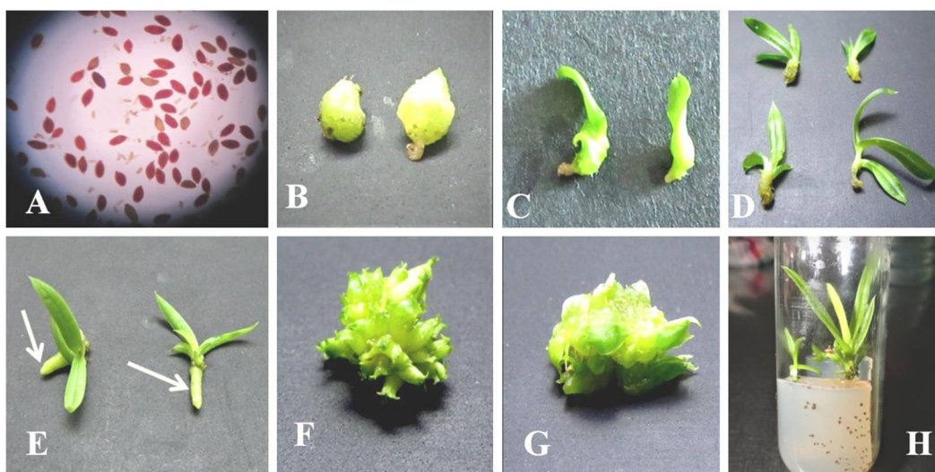
Fig. 2. The seeds and different developmental stages of seedlings of Vanda tessellata : A. TTC treated seeds of V. tessellata . B. Globular stage (Stage 1). C. Leaf primordial stage (Stage 2). D. Leafy stage (Stage 3). E. Rooted stage (Stage 4). F. Multiple protocorm like bodies. G. Callus differentiating into PLBs. H. Rooted plantlets during culture condition.

(Kauth et al. 2008, Koene et al. 2019). In case of media supplementation with peptone, majority of the propagules were restricted at leaf primordial stage in LM + 0.1% P medium. Globular stage protocorms (Stage 1) were only recorded in MS + 0.1% P medium as maximum necrosis in all other treatments occurred at globular stage. Leafy stage (Stage 3) and rooted stage (Stage 4) were recorded in all the four media combinations except in LM + 0.1% P. Leaf primordial stage (Stage 2) was found to be most abundant and was found in all the media combinations (Fig. 2C, Table 1). Apart from these four stages, multiple protocorm like bodies was only recorded in MKC + 0.1% P medium. Maximum number of roots was developed in VW + 0.1% P medium (Fig. 1D).