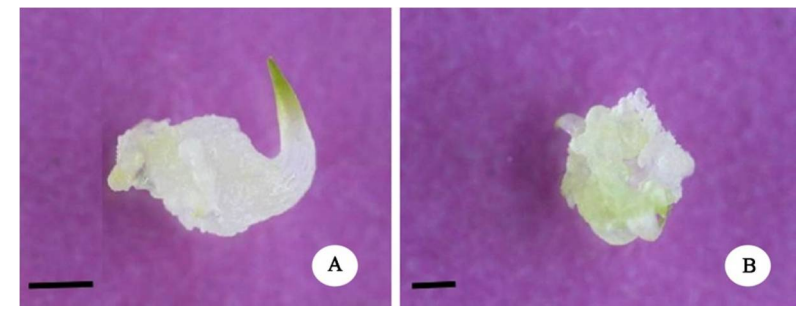
Fig. 1. Callus induction and proliferation in Dendrobium barbatulum . A. Injured PLB initiated the development of callus on half strength of MS + BAP 3.23 µm after 7 weeks. Scale bar = 1 mm. B. Proliferation of callus on the same medium after 11 weeks. Scale bar = 1 mm.

Table 2. Development of Primary PLBs from the protocorm derived callus of D. barbatulum in half strength MS with BAP.