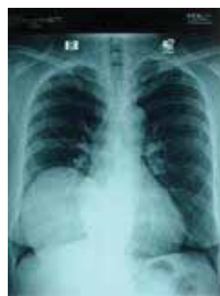
Fig 1: Chest X-ray P/A view before removal of cyst.

Patient also complained of occasional cough but no episode of haemoptysis. She had no constitutional symptom like anorexia, weight loss, and fever. Her physical examination reveals no significant abnormality but diminished breath sound in right lower chest. Chest X-ray (Fig 1)