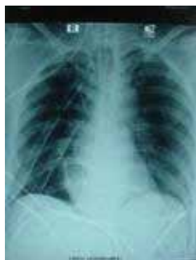
Fig: Chest X-ray P/A view after removal of the the mass.

Neurogenic tumors comprise 19% to 39% of all mediastinal tumors. They develop from mediastinal peripheral nerve, sympathetic and parasympathetic ganglia, and embryonic remnants of neural tube. Because posterior compartment of mediastinum includes spinal nerves, vagus nerve, and sympathetic chains, neurogenic tumors of the mediastinum are most commonly present in the posterior mediastinal compartment. Among posterior mediastinal neurogenic tumors, schwannoma is the most common. Mediastinal benign schwannomas originate from Schwann cells. They affect both genders equally and develop predominantly in the third and fourth decades of life. Multiple tumors can be presented with neurofibromatosis. Mediastinal benign schwannomas are most often asymptomatic. However, sometimes mediastinal benign schwannomas can cause severe problems such as cardiac tamponade or pleural effusion, though bloody pleural effusion is usually associated with malignant schwannoma. Benign schwannomas are typically treated by surgical resection. VATS can decrease hospital stay and minimize post-operative complications; it has become the preferred method for resection for posterior neurogenic tumors. In the present case, we performed open thoracotomy because the mass was large and fixed to the posterior thoracic wall. It is important to note that postoperative course may be complicated in schwannoma cases by