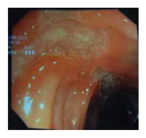
Fig: Image shows colonoscopic findings of ulcerative colitis