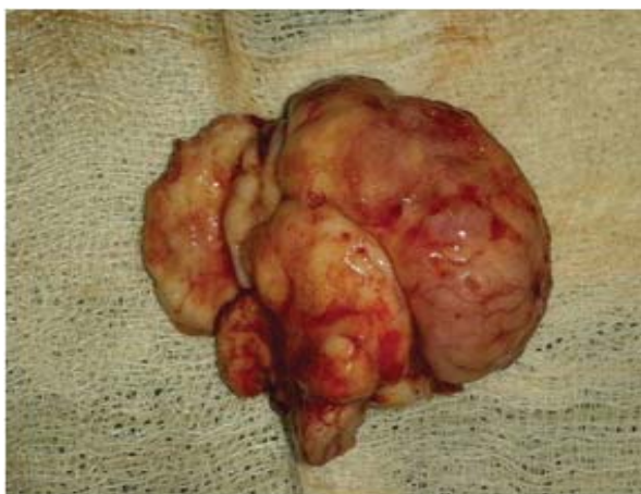
Fig. 3: Excised tumor