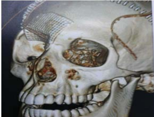
Fig. 5: Post-op CT Scan

Post-operatively on follow-up patient's proptosis and limited upward gaze improved along with right eye visual acuity (from 6/60 to 6/12). Subsequent follow up shows no complications