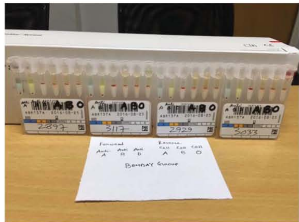
Fig. 5: Bombay blood group bags received from Think Foundation of Mumbai