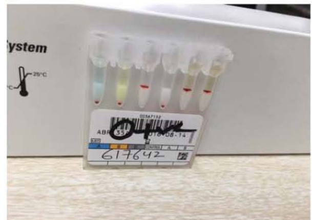
Fig. 1: Patient's blood grouping showing O positive without using O cell in reverse grouping by column agglutination technology (gel card)

type. The patient has also given history of his maternal aunt was diagnosed as O positive but died immediately after blood transfusion. Transfusing O group blood would lead to acute transfusion reaction since all anti-H immunoglobulin can activate the complement cascade leading to intravascular red blood cell lysis, provoking an acute transfusion reaction. On 20th June, the patient had his orthopedic surgery and received Bombay blood arranged from the Blood Foundation of Mumbai, India.