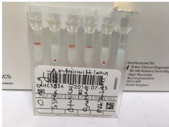
Fig. 4: Comparing the patient (Oh phenotype) and her sister's (Oh phenotype) Red cells showing no reaction with Anti H lectin and his brother (OH phenotype), O positive and O negative cells(OH) showing strong reaction with Anti H lectin by column agglutination technology (gel card)