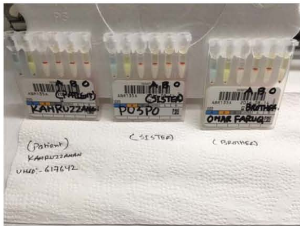
Fig 3: Comparing the patient (Oh phenotype) and her sister's (Oh phenotype) blood grouping showing strong reaction with O cell in reverse grouping and his brother (OH phenotype) showing no reaction in reverse grouping by column agglutination technology (gel card)