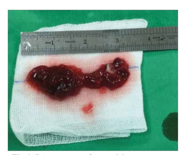
Fig.4: LA myxoma after excision out

The most common primary cardiac tumor is the benign myxoma, which in the large majority of cases is solitary. The mean age of presentation with sporadic myxoma is 56 years and 70% are female.<sup>3</sup> Risk factors for atherosclerosis such as systemic hypertension, dyslipidemia and coronary artery disease is also higher in this age range. Prevalence of coronary artery disease in patients with myxoma has been reported between 20.3% and 36.6%.<sup>3,4</sup>