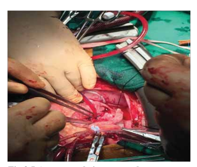
Fig.3:LA myxoma being scooped

operation. Patient was recovered nicely with minimum inotropic support. Extubation was done after 12 hours. On 3rd post-operative day, patient was shifted from ICU to ward. Histopathological examination showed a tumor composed of round, polygonal or stellate cells arranged in clusters in a myxoid stroma admixed with blood clot and fibrin mass consistent with myxoma. Echocardiography on 5th postoperative day shows IVS is hypokinetic, paradoxical, MR grade I, mild AR, Aortic cusps