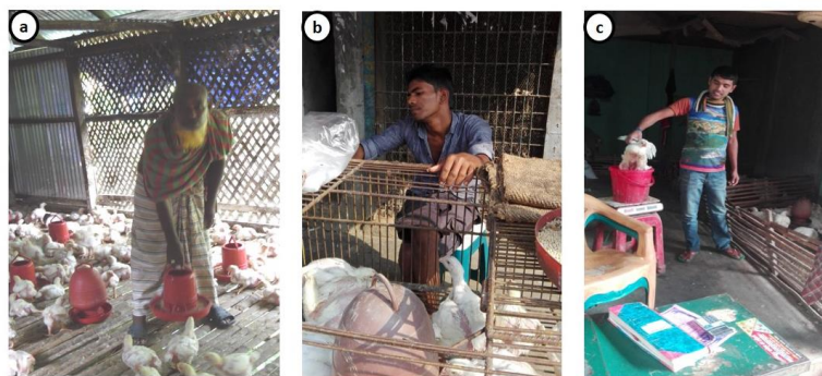
Figure 3. Broiler farmer (a), wholesaler (b) and retailer (c)

Paikers are the small traders and perform their business independently. They do not have any permanent establishment but they have fixed places in the market centre.