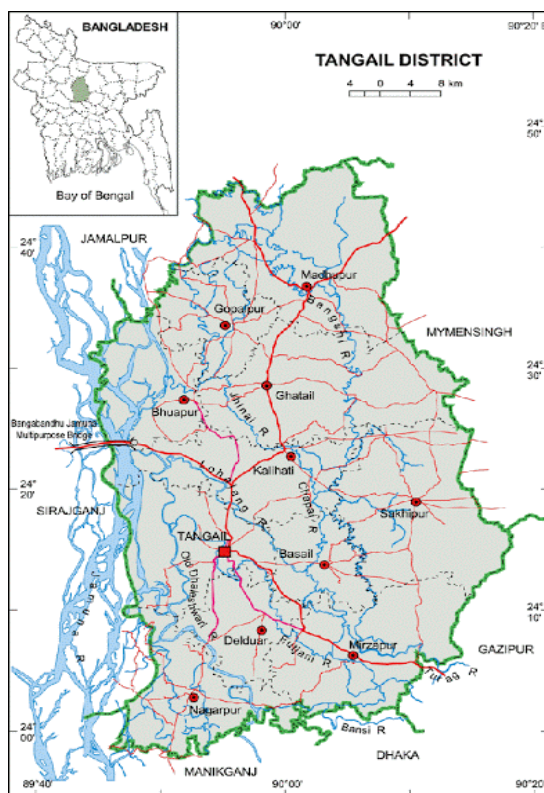
Figure 1. Showing location for data collection