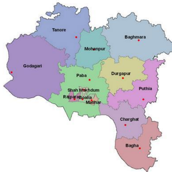
Figure 1. Location of the Study Area Baghmara Upazila, Rajshahi District