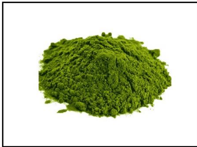
Figure 1. Wheat grass powder

(tray). Then water was sprayed over the trays and covered it for 2 days. After 2 days, the sprouted young wheatgrass of yellowish color was uncovered and brought to passive sunlight. Until the harvest, the water was sprayed over the sprouting bed twice daily (morning and evening). When the seedlings (dark green colors) become 6-7-inch-long within 8 days it is termed as sprouted and then the stems were cut down as well as weighed for further use. These sprouted wheatgrass were then subjected to blanching, a process of scalding vegetables in boiling or steaming water (75 to 105 °C) for a short period (1 to 10minutes). The objective of the process is to inactivate enzymes, remove air and gases, set the color, improve the texture, retard the changing of flavor and leaching of water soluble sugars. Simultaneously, blanched vegetables need to cool down promptly to minimize the degradation of heat liable nutrients. Here, the green wheatgrass stems were boiled for 7 minutes. Then the boiled stems were cooled down in a big bowl by adding ice and one pinch of sea salt (NaCl). After blanching, the wheatgrass was kept in a well-ventilated room under fan to facilitate air cooling. Then the wheatgrass was dried into dryer and resulting crunchy stems were cut into small pieces with scissors and blended into powder (Figure 1) to use as fish feed ingredients later.