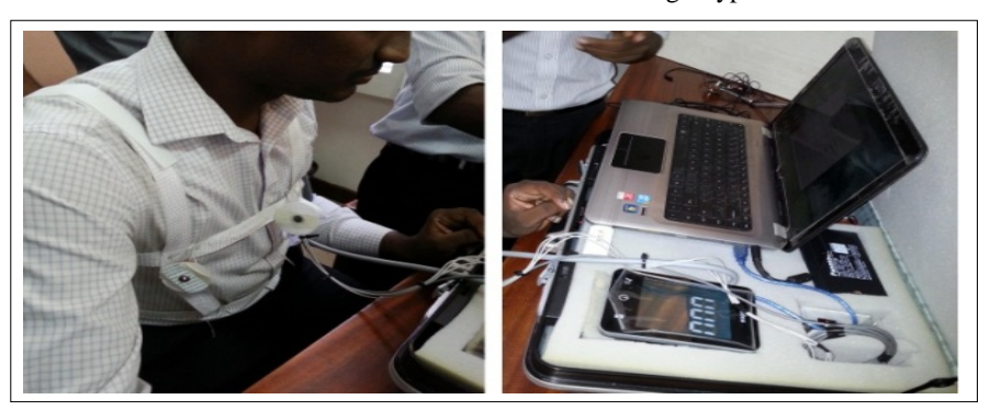
Fig. 1. Wearable sensors kit and remote-end device.

Communication between RMCS device and doctor's terminal is established using Internet. RMCS at remote end is capable of connecting to cloud through a mobile broadband or wireless/wired internet connection. At remote end sensors are connected to eHealth platform and Arduino which communicates with the laptop using serial communication. Arduino is interfaced using a Java desktop application which gathers the sensor outputs and upload the data to the server. At the doctor's end terminal, doctor can access the data in the server using a web based application. Video conferencing also can be established between telemedicine kit and doctor's end using Skype.