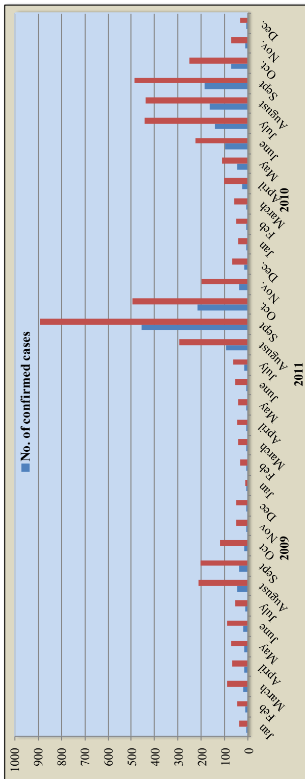
Figure 2: Monthly trend of malaria cases from 2009-2011