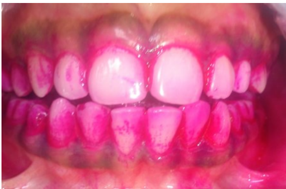
Figure 2: Sample of oral photo taken after staining for dental plaque

After the oral examination, only the intervention school received oral health education, led by a dentist and a health educator from Grameen Communication. First, individual face-to-face instruction on dental exercises was provided by a dentist; the dentist showed the students how to hold the toothbrushes, how to brush, and where to brush. This was followed by a 20-minute group dental seminar, provided by a health educator in a large classroom to increase awareness of the importance of good dental care. In this session, a 1-page pamphlet with oral health-related illustrations was provided to all