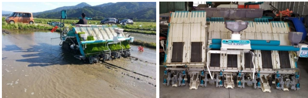
Figure 1. Self-propelled (Kubota NSU-87) transplanter

The self-propelled rice transplanter equips with a Seedling Feed Stopper, Float, Planting Fingers, and Side marker to ensure precise and efficient transplanting. It is capable of planting seedlings at a consistent depth, which is essential for uniform growth and maturity. In addition to its precision planting capabilities, the transplanter is designed for efficiency, allowing farmers to quickly transplant large areas of paddies. It has a 30 cm row spacing and 2.4 m width (Figure 1).