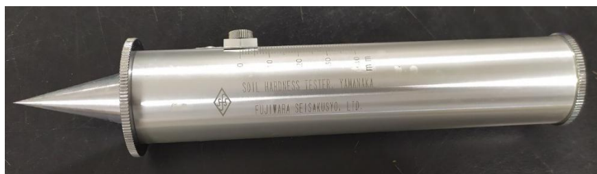
Figure 3. Soil hardness tester

It is essential to ensure the soil hardness is optimal for the best performance of the transplanting machine and overall fieldwork efficiency. Soil hardness is an indicator of the soil's compaction status; large pores are necessary for water and air movement to allow roots and organisms to explore the soil. A soil hardness tester was used to measure the soil hardness depth (mm) and pressure ( \text{kg}/\text{cm}^2 ) of the experimental field before and after puddling (figure 3).