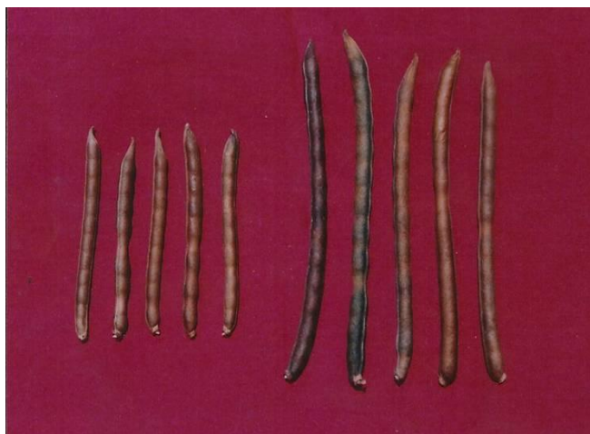
Figure 1. (a). Pods of var. NM-1 (control)

Three quantitative traits, namely pod length (cm), number of seeds per pod and 100-seed weight (g) were statistically analyzed to assess the extent of induced variability in M_2 and M_3 generations. Pod mutations with increased length and girth over the control were recorded in M_3 generation. The plants were normal in appearance with comparatively bigger pods. Plant height, primary branches per plant, pod length, seeds per pod and seed yield per plant was significantly increased over the control in these mutants. Data for pod length showed that most of the mutagen treatments were not proficient to induce significant differences in mean pod length in M_2 generation. Also, the mean pod lengths shifted on either side of the control mean (Table 1). However, there was a significant increase in mean pod length with 0.02% (Figure 1b) and 0.03% of EMS treatments and with 0.02% of HZ and SA treatments in M_3 generation.