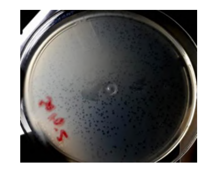
Figure 1. The lysates formed by the P4CSa phage over the bacterial growth.

This result demonstrates that the filtrate of the phage P4CSa lysate can resist the conditions of storage adopted in this study. This preservation condition can be suggested for long term storage of formulations contenting this phage.