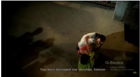
Raju (Bubli's brother) is Beating Bubli for coming to her family.