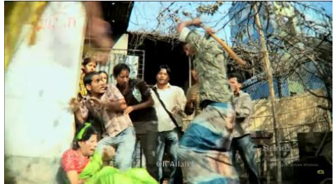
People and one security guard are beating Bubli for using public toilet.