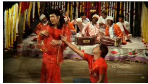
Appendix-1.3 (Live in shantytown)

In both pictures, the transgender women are dancing and singing to entertain people.