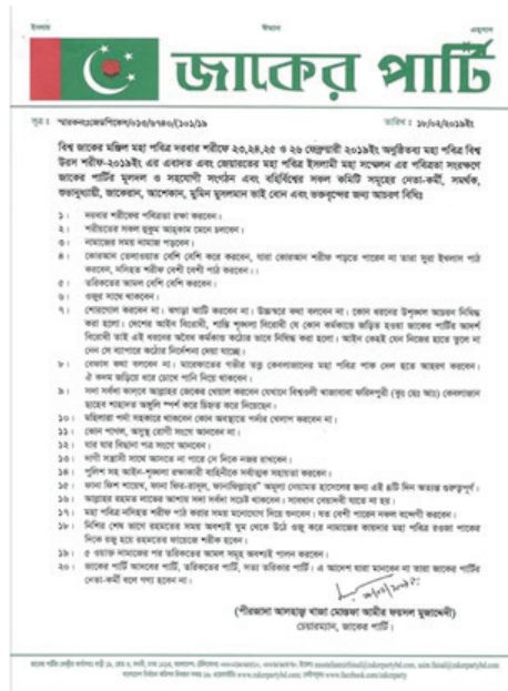
Figure 1: A copy of Zaker Party Chairman’s letter to its leaders and activists to join Atroshi Pir’s annual urs in 2019.

In it ZP chairman officially asked party leaders and activists to join the religious programme – the 2019 annual urs – that he would be hosting as Pirjada (son of the Pir). The last instruction of the letter carries particular significance, maintaining that “Those who do not comply, will not be considered leader or activist of the party”. Such statements clearly indicate that ZP did not differentiate between its party activists and the darbar ’s murids . Moreover, its head office at Dhaka and all other branches across the country are now treated as the darbars of Atroshi Pir, reinforcing the impression that the spiritual and the political merge within ZP framework. Like BKA and IAB, ZP also commands its leaders and activists to refrain from taking what belongs to other(s), oppressing the weak, and destroying or wasting property. They are to love every creation of Allah, prevent ethical degeneration and seek to reduce so-called un-Islamic activities in wider society. Through spiritual means the aim is to turn every soul towards Allah, and, thus, unite the Muslims and establish peace (Islam) in the world (Mills, 1992).