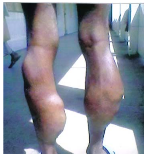
Fig-1: Subcutaneous lesions on both legs As a part of academic exercise two larger leg lesions were also excised on next available

FNAC of the left forearm and leg swellings were done in the pathology department of Rajshahi Medical College. But the reports were inconclusive. Subsequently a moderate size lesion over the left forearm was excised completely and was sent for histopathologcal examination. Histopathology report revealed multiple mature and immature cysts (sporangia) packed with spores. There were chronic inflammatory cells infiltrating normal tissue. The into histopathological diagnosis was rhinosporidiosis.