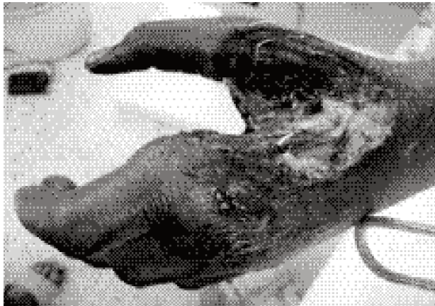
Fig-1 : Ischaemic gangrene resulting from subclavian artery thrombosis