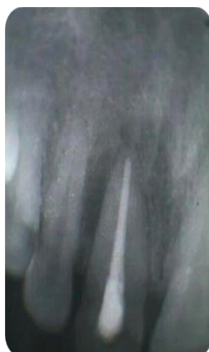
Fig. 6 : Final radiograph showing obturated canal