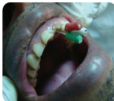
Fig.4 : File Braiding Technique