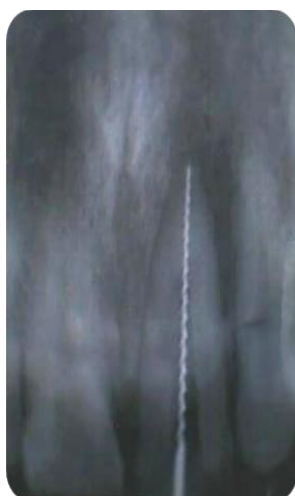
Fig.5 : Measurement of working length