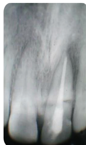
Fig. 7 : 3 months follow up