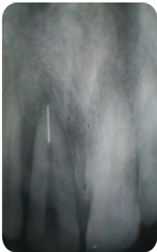
Fig.1 : Radiograph showing a fractured central incisor Instrument wedged in root apex of Maxillary left

On clinical examination, the tooth was restored with temporary filling. Discoloration of tooth & intra oral sinus was also found on the labial surface of maxillary left central incisor tooth. Radiography showed a radiolucent area around the apex and a fractured instrument was wedged at the apex of the maxillary left central incisor. The affected tooth was then treated as removal of fractured instrument followed by root canal treatment.