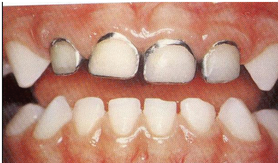
Fig. 02: Modification of Stainless Steel