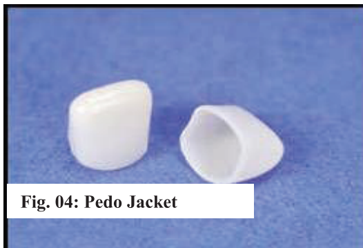
Fig. 04: Pado Jacket

Appropriate local analgesia should be obtained and the tooth should be isolated, preferably with rubber dam. Caries removal and appropriate