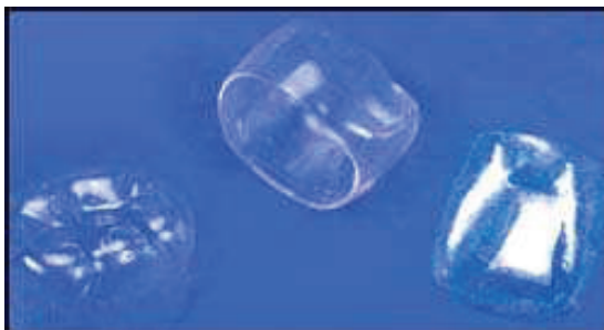
Fig. 03: Strip Crown