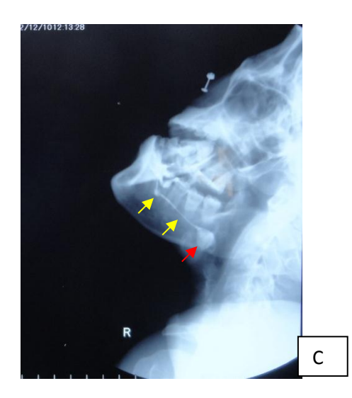
Figure 1: Preoperative radiograph of OPG (A), P/A view of skull(B), sialograph(C) show the sialolith (red arrow) and salivary duct (yellow arrow).

The sialolith was surgically removed along with the right submandibular gland by extraoral (submandibular) approach [Fig:4 (A&B)]. No clinical signs of marginal mandibular nerve injury was noted after operation.