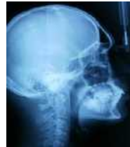
Figure 4: Patients pre treatment oral panoramic radiograph (OPG), (a), lateral cephalometric radiograph (b) and post treatment lateral cephalometric radiograph shows marked improvement of occlusions.