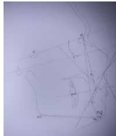
Figure 3: Lateral cephalometric tracing shows the change of skeletal pattern change from pre treatment(a) to post treatment(b).