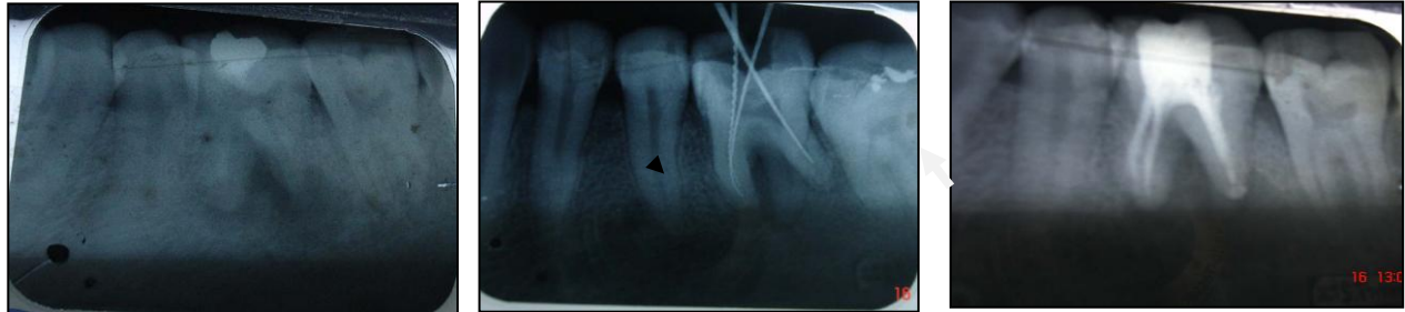
Figure 2. (A) Preoperative radiograph (b) Length determination radiograph, where the RE is visualized (Demarked).

Sweden) and the patient was referred to the Prosthodontist for restoration by permanent restoration as full veneer crown.