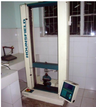
Universal Testing Machine

When the temperature reaches 100^{\circ}\text{c} then stopwatch was used for record the time. The flask was allowed to bench cool before deflasking . Following the bench cooling procedure the flask was opened and acrylic pattern was carefully retrieved . Excess flash of the sample was trimmed by laboratory micro-motor with burs , finished by sand paper and polished with pumice powder . The polished samples were measured with vernier caliper to ensure that the samples were 65 \times 12.7 \times 2.5 mm (2). A total of 60 samples were fabricated and to evaluate the strain at break of all the specimen of this study were tested by Hounsfield Universal Testing Machine(4) and were measured by QMAT software in the computer