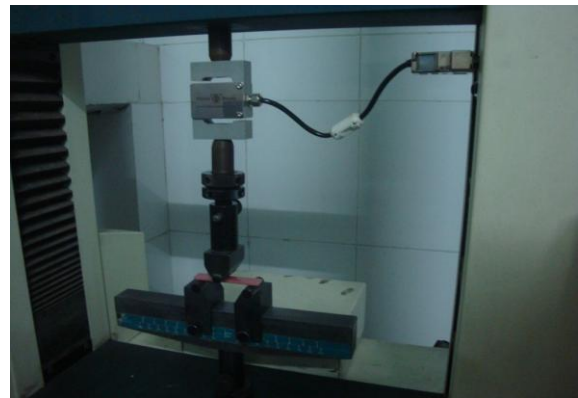
Placement of sample in Universal Testing Machine