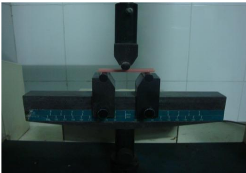
Focusing the sample in three point bending part of UTM