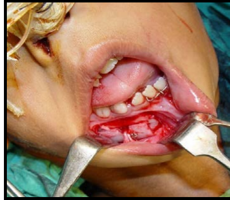
Figure 3: Surgical fixation by using intraoral bi-cortical screw.