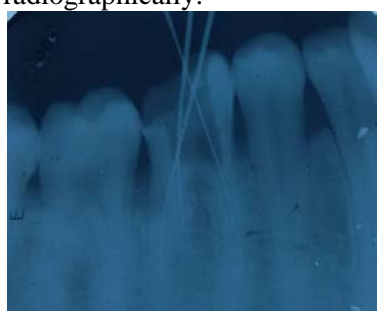
Figure 3: Photograph of working length determination. Two separate roots can be distinguished when radiograph is exposed 30 ^{0} from mesial arrow.

lingually oriented access inclination. Radiographic length measurement was performed (Figure 3). All canals were prepared in crown down method with pro-taper hand instruments. After canal preparation, root canals were irrigated with 2.5% sodium hypochlorite solution. The gutta-percha cone fit, with, confirmed the presence of third root (RE) (Figure 3). The root canals were filled with gutta-percha which was revealed by radiographical exposure 30 degrees from the mesial where the radix entomo radiographical exposure 30 degrees from the mesial was cleary evident.) figure: 4) and after obturation the access cavity also showed four points of gutta perchae. Endodontic access cavity was then sealed with amalgam restoration. After one year follow up, there was no change in the root canal treated 36 both clinically and radiographically.