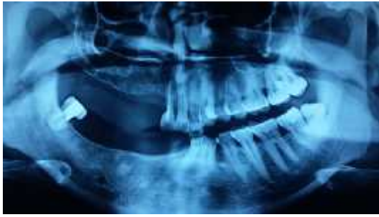
Figure 6: Radiograph showing progression of resorption even after root canal treatment on 48 and 11.

Throughout the total follow up period of 6 years, there was no positive clue for diagnosing the case. But, the nature of destruction as seen clinically and mostly by sequential radiograph (OPG) that showed radiolucency with poorly defined borders in the cervical third of the root from one tooth to other and one jaw to the another in a progressive way even crossing the midline also. So we rather want to say that this is a case of progressive idiopathic cervical/external root resorption.