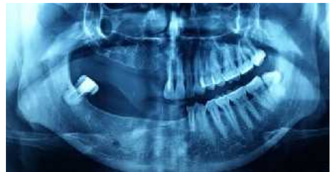
Figure 5: new progression of resorption like pathology in the form of cervical radiolucency seen in tooth no 21,23 and 27.

A new progression of resorption like pathology in the form of cervical radiolucency seen in tooth no 21,23 and 27. (fig 5) During follow-up for last 6 years, there were evidences of ongoing resorption of teeth no. 48 and 11, which were root treated (Figure 5&6).