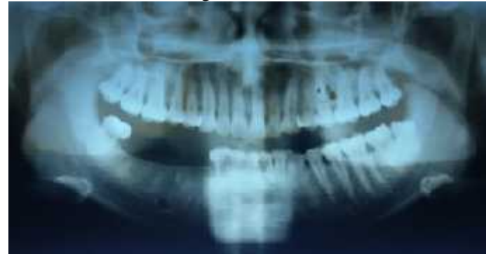
Figure 1: OPG showing radiolucent area with poorly defined borders found in the cervical third of the root on teeth no 31,41,42,43 and 48.

cervical third of the root on teeth no 31,41,42,43 and 48. [Figure 1].