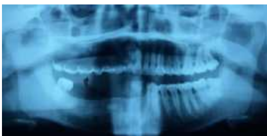
Figure 3: Radiograph showing progression of the resorptive lesion already involved and extended from tooth no 11 upto 18.

Considering that the pathology may be an internal resorption, root canal treatment advised for tooth no. 48 to arrest the progression of the resorptive lesion; while because of the extensive destruction, extraction was advised for tooth no 15, 16 & 17. Patient's urgency rendered to dispose him without any treatment this time. When the patient came back again after 2 more years, we found progression of the resorptive lesion already involved and extended from tooth no 11 upto 18. (Fig 3)