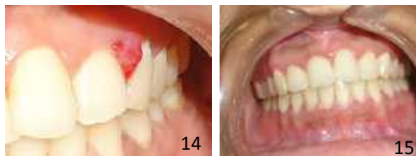
Figure: Initial lesion and 19 months after the surgical excision (Fig.-14 -15)

receptors for steroid hormones 2 and thus the increase in estrogen and progesterone can cause changes in the physiology of gingival tissue 1 . Such changes can enhance the response of gingival tissues to local irritants such as plaque and calculus. In this case, the clinical examination showed low, however present, accumulation of plaque and a small amount of tartar on the teeth, mainly related to the lesion. Presumptive clinical diagnosis was pyogenic granuloma, taking into account the clinical features of the lesion. It should be noted that the definitive diagnosis of lesions in oral soft tissues can only be made after histopathological examination which, in this case, confirmed the diagnosis 4 .