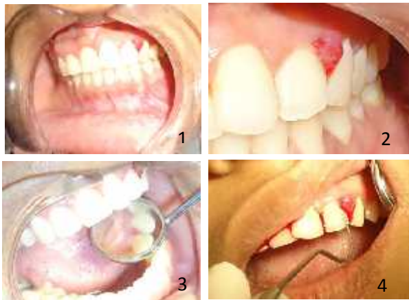
Fig: Clinical intraoral examination revealed an area with gingival hyperplasia of a reddish color with irregular surface and sessile mass lesion extending to the labial and slight to palatal area in between the teeth no 22 and 23 (Figure 1-3). spontaneous bleeding on probing (Figure 4).

A 25-year-old female in the fourth month of pregnancy was referred to the Periodontology department of Update dental College & Hospital. She presented a polypoid sessile gingival mass on the labial and palatal aspect of teeth 22 and 23.