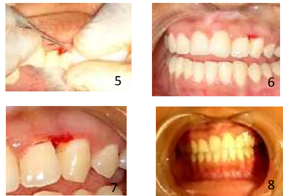
Fig: Surgical excision and area is protected with zinc oxide eugenol cement. (Figure 5-8)

labial aspects of teeth 22 and 23, was completely excised and submitted for histopathologic examination. (Figure 05-07) At the time of the procedure under local anesthesia with lidocaine 2% and 1:100,000 epinephrine. After removal of the lesion, the scraping technique was performed with curette and scalpel blade no-15, to restore the aesthetic contour of the affected gingival region. After surgical excision, the area was protected with zinc oxide cement (Figure 08). The patient was advised to use 0.2 percent chlorhexidine gluconate solution twice a day for ten days for periodontal maintenance.