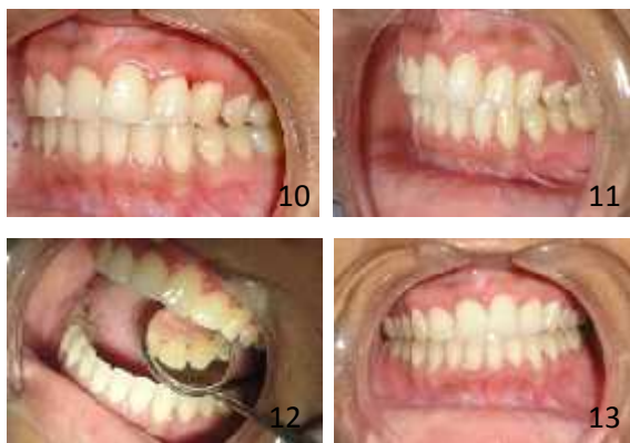
Figure: After 1 weeks, the gingival tissue showed a beginning of healing within the expected normality (Figure 10). After two months of the periodontal surgery, Gingival tissue show approximately normal in feature and was noted the symmetry with right side . (Figure 11-13).

It was determined that the patient could maintain adequate plaque control. After six months of healing, the patient was pleased with the aesthetic results that addressed and at the 19 months postoperative visit, the periodontium and anterior dentition appeared to be healthy, and there was no recurrence of the pyogenic granuloma . A follow-up examination showed satisfactory resolution of the clinical case and suggested a favorable progression in the periodontal tissues involved. (Figure 14-15)