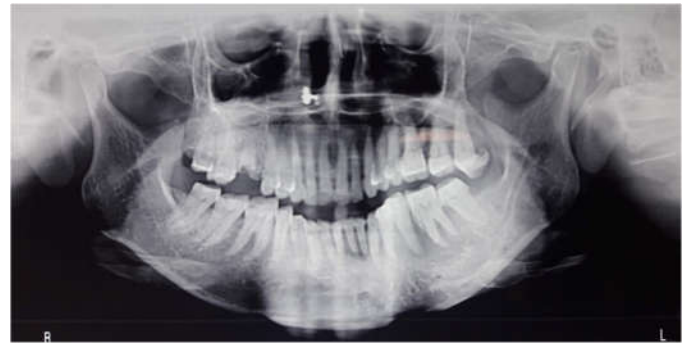
Fig 4. Well-circumscribed radiolucent circular lesion in the area between lower left 5 and 6 number teeth

Her oral hygiene was below average. Systemic examination was unremarkable. There was no evidence of cervical lymphadenopathy. The patient's medical and social history was non-contributory and she did not receive any medications. The lesion presented as an asymptomatic, intraosseous lesion in the left mandibular molar region as demonstrated by orthopantomographs (OPG). Radiographic evaluation revealed a well-circumscribed radiolucent circular lesion in the area between teeth numbers of lower left 5 and 6. (Fig.4)