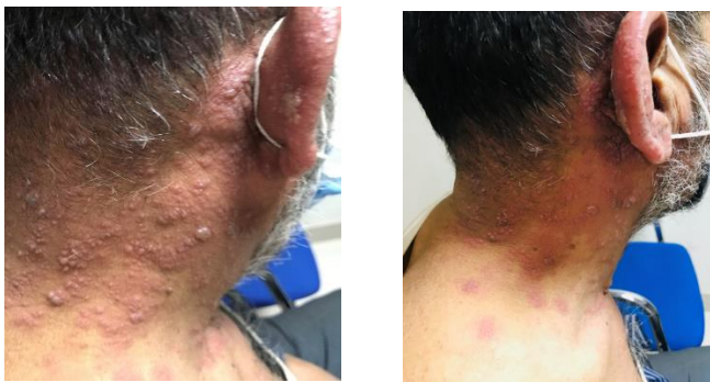
Fig 1: (Left side) Multiple vesicles with surrounding erythema involving C3 distribution of right side of the neck. Fig 2: (Right side) Multiple vesicles with surrounding erythema involving C3 distribution of right side of the neck

He was treated with broad spectrum antibiotic, LMWH, Montelukast and bronchodilator for Covid pneumonia however for HZ, he was prescribed valaciclovir 1gm TDS for 7 days. Since starting medication his respiratory symptoms and HZ rash significantly improved with residual pain at the HZ site.