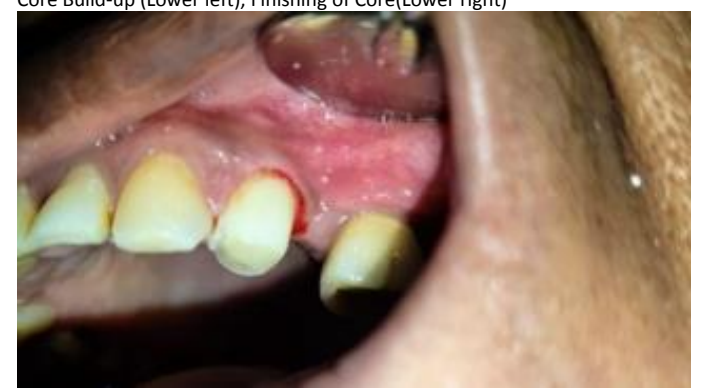
Figure: After Finishing