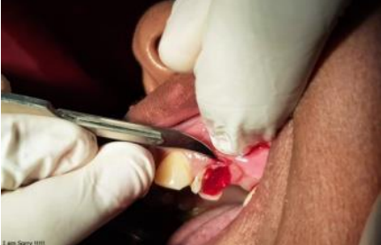
Figure: Initial Radiograph (on Left) , Surgical Crown lengthening