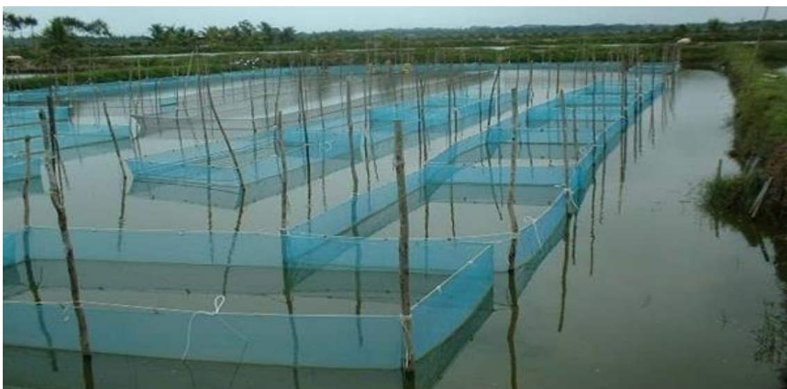
Figure 1: Nursing of Fry in Hapa

Methodology is an indispensable part of any researchers. The methods of data collection depend upon nature, aims and objectives of the research undertaken. There were several methods of collection of data and information. Among those methods selection of a particular method depends on many considerations. The research methodologies of