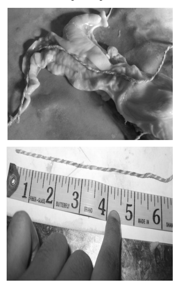
Figure 3: Measuring the Horn of the Uterus using thread

of the cervix to the ventral commissure of the vulva. A measurement of the vaginal width was regularly taken at a point approximately 3 cm. from the external os of the cervix, prior to extending the dorsal incision through the vagina.