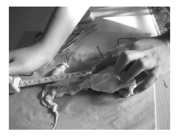
Figure 5: Measuring the length of cervix

All measurements were recorded in a tabular form. Then the tabulated data were entered into computer using Microsoft excel worksheet and analyzed for descriptive statistics. The significance between both right and left ovaries treatment and ovario-bursal adhesion was tested using SPSS (version-10).