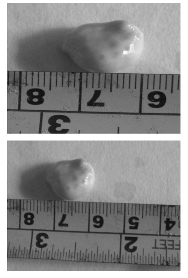
Figure 1: Measurement of the Length and width of Ovary

Before the measurement all logistics were collected and prepared in the laboratory. A metric ruler, an electronic balance, a large dissection tray and hand gloves were collected. The tray and electronic balance were placed on laboratory table in bright light area. Thawing was carried out by placing the frozen specimens in cold water.