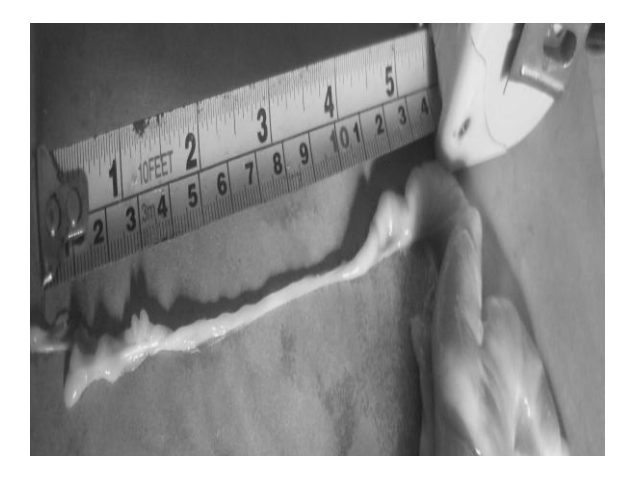
Figure 2: Measurement of the Length of Fallopian Tube

The organs were cleaned and freed from adhering tissues and placed on a table in normal position. Different segments of the tracts i.e. vulva, vagina, cervix, uterine body, uterine horns, oviducts and ovaries were measured. The reproductive tracts were measured using metric rule, thread and hand lens. The ovaries were removed at their junction with the ovarian ligament -as close to the ovarian tissue as possible after the fimbria was removed. The length of ovary was taken along the excision from the ovarian ligament and the width as the greatest line perpendicular to the length line (Fig.1). The weight of the ovary was measured using electrical balance. The follicles and corpus luteum were counted in each ovary using magnifying glass <sup>[11]</sup>. The oviducts were dissected out, and a measurement taken on their extended length from the top of the fimbriae to the tubal uterine horn junction. The lengths of the oviducts were taken from the uterotubal junction to the fimbriae (Fig. 2) and the diameters calculated from the circumferences [11].