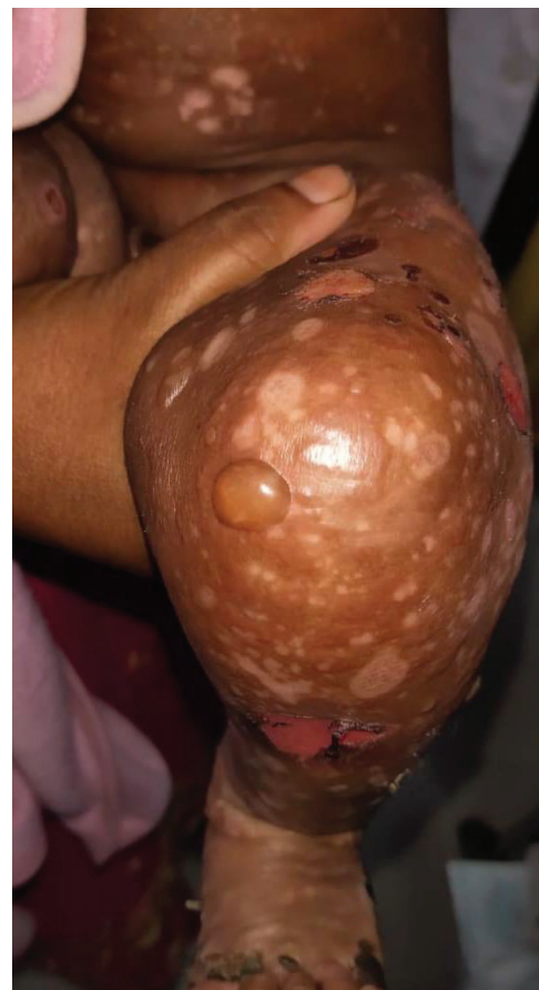
Figure - 1: A tense bullae on knee joint

smear was taken in a cleaned glass slide from a fresh intact bullae (showed in picture). Two smears were taken in two slides from scraped material at the base of the bullae. The slides were sent to the department of Laboratory Medicine for examination. The slides were dried properly and stained with Giemsa and examined under light microscope. There were many eosinophils detected in both slides. There was no acantholytic keratinocyte and no other type of blood cell was found. So the Tzanck test report was in favor of bullous pemphigoid.